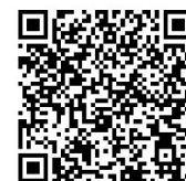
2025 Welcome Registration

The Women's Welcome Retreat will be held at the Ottoville Parish Center on March 29 & 30. Any monetary donations can be put in the envelopes provided and placed in the donation box in the church narthex. There is also an option of using the QR code attached to the envelope (or below). Thank you! Your contributions are greatly appreciated!