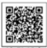
Online Giving Option For Women's Welcome Retreat

Want to donate to the Women's Welcome Retreat ? Any monetary donations can be put in the envelopes provided and placed in the donation box in the church narthex. Online donation is available using the QR code (left). Thank you! Your contributions are greatly appreciated!