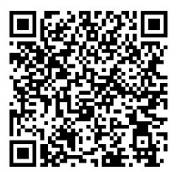
2025 Welcome Registration

The Women’s Welcome Retreat. Monetary donations can be put in the envelopes provided and placed in the donation box in the church narthex. Or use the QR code attached to the envelope (or here). Thank you! Your contributions are greatly appreciated!