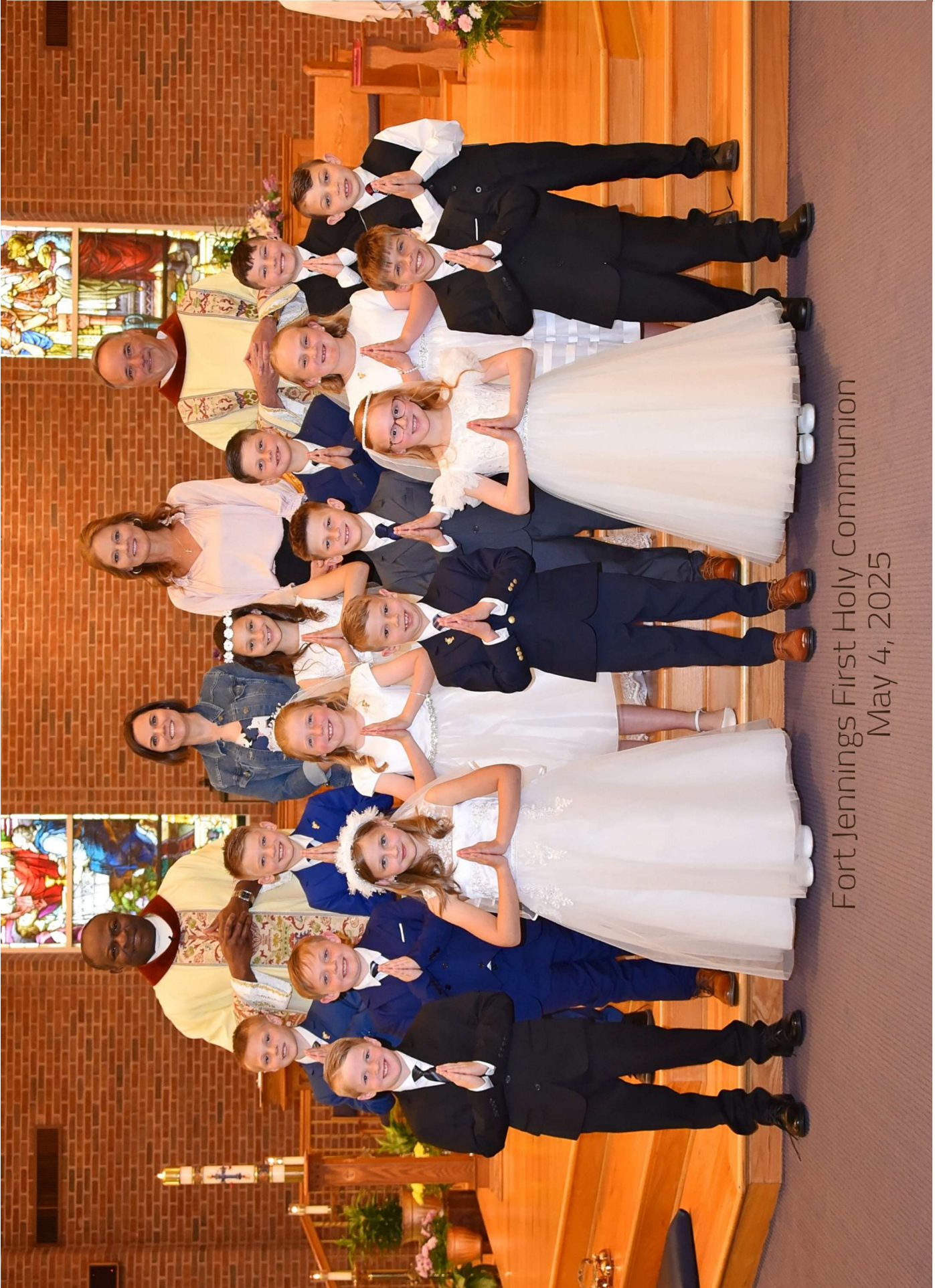
Fort Jennings First Holy Communion May 4, 2025